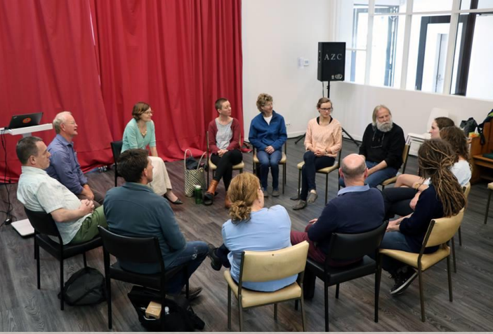
Have a chat with A Rocha