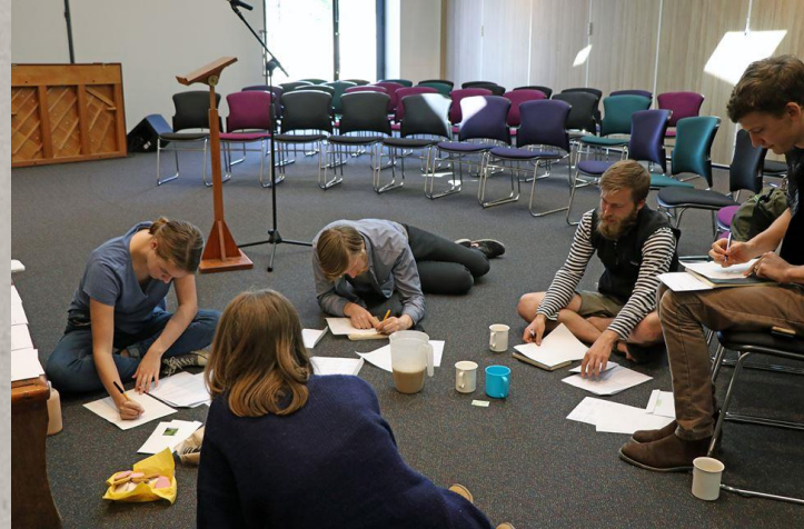
Put your money where your mouth is

The afternoon involved these Action Groups: