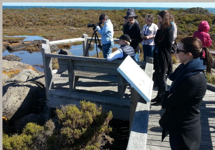
Port Phillip Bay birdwatching