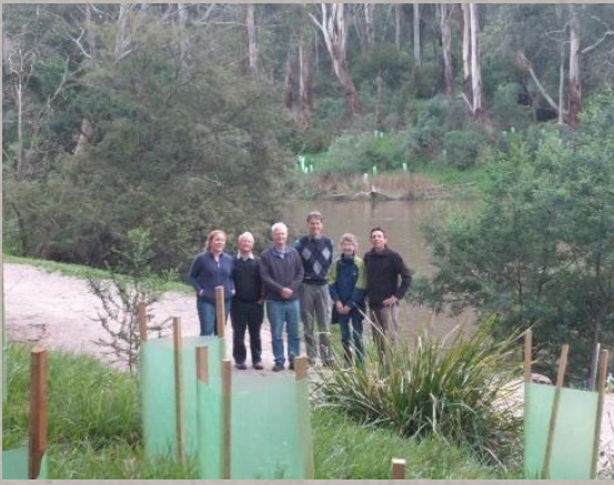
Board directors out and about in Melbourne