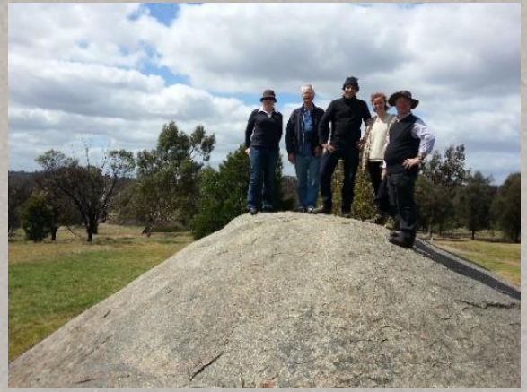
This is apt! "A Rocha" means "The Rock" in Portuguese