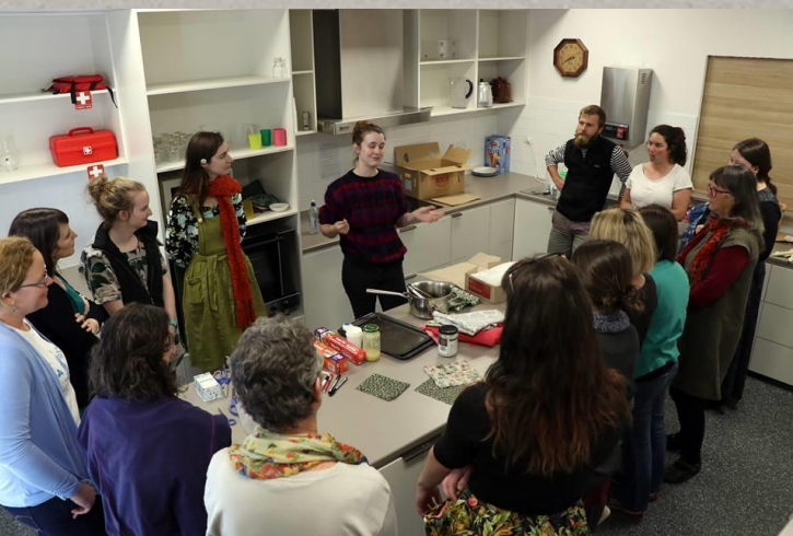
Make your own beeswax wraps