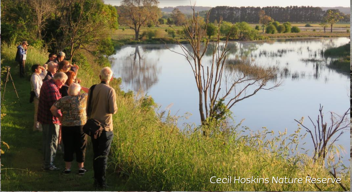
Cecil Hoskins Nature Reserve