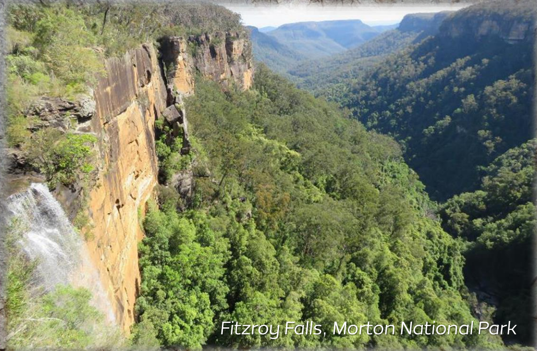
Fitzroy Falls, Morton National Park