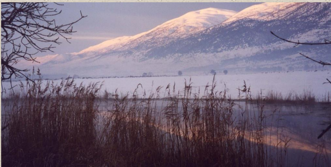
Aammiq Marsh.