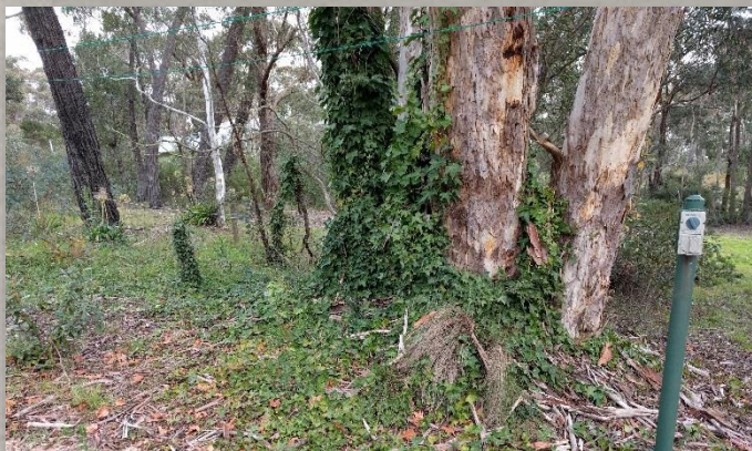
English ivy escaping into bushland

Here are some weed issues at other campsites that we hope to start tackling in 2017: