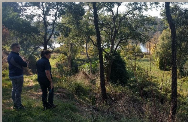
Discussing tree planting post-lantana control

With so many Christian campsites around Australia there may be great opportunities to connect some with A Rocha Australia, and for us to perhaps help enable them to care more for God's Creation in word and action.