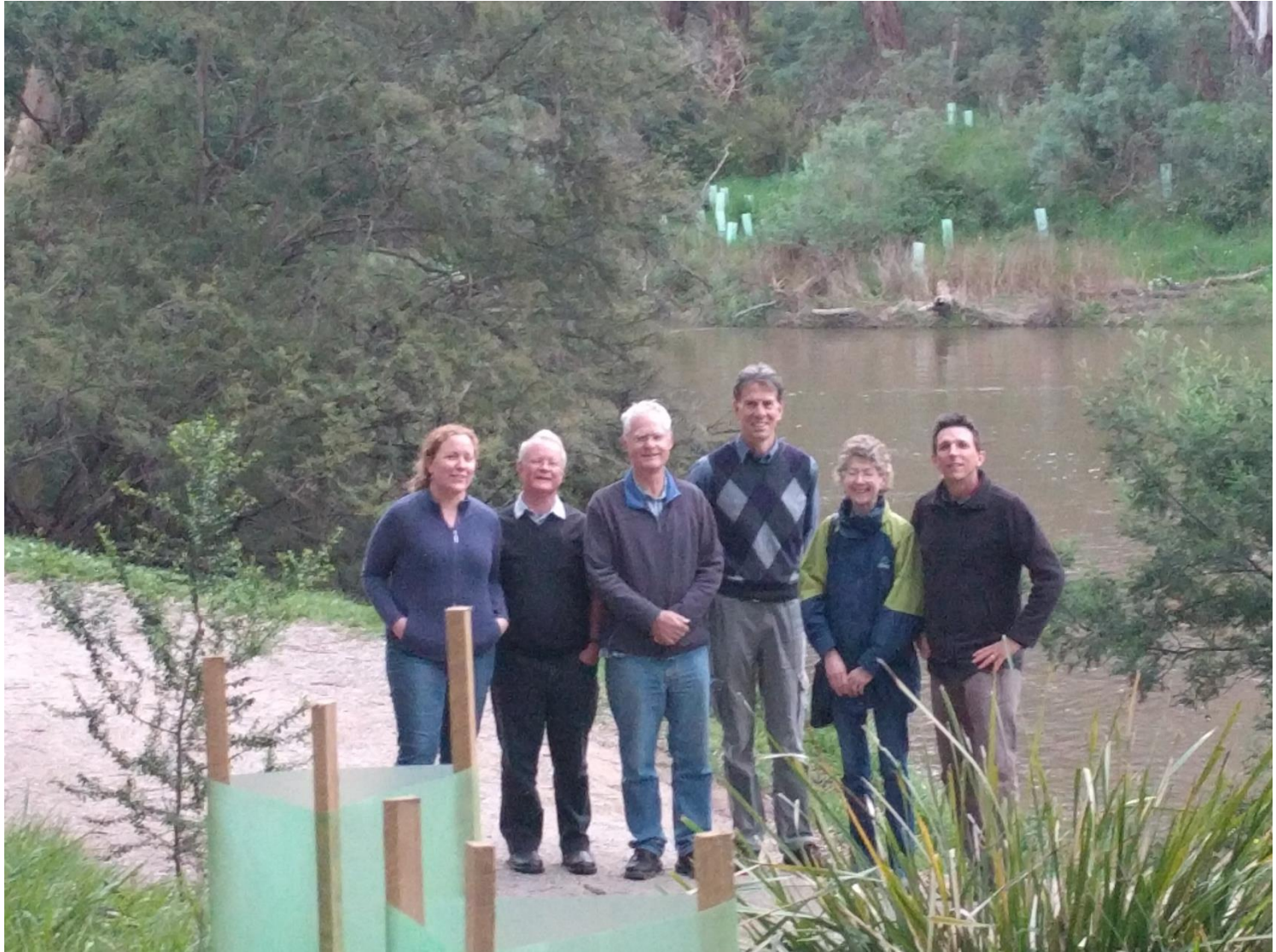
Directors of A Rocha Australia, 2017