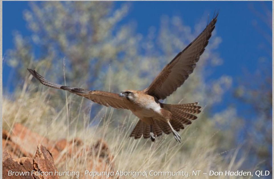
Brown Falcon hunting, Papunya Aboriginal Community, NT