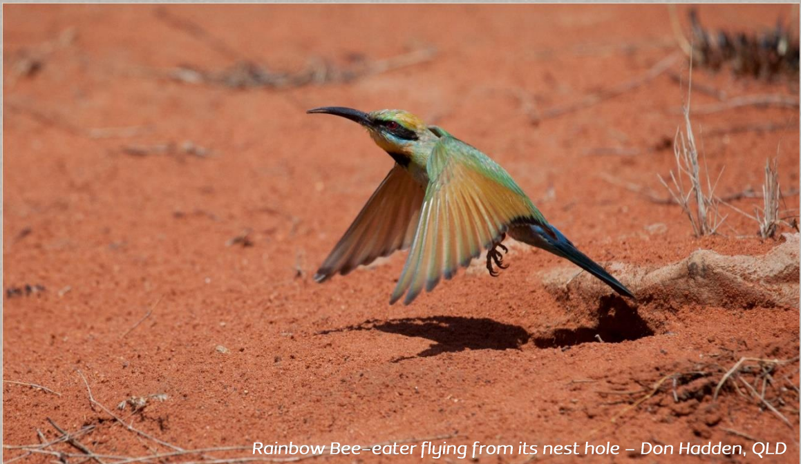
Rainbow Bee-eater flying from its nest hole – Don Hadden, QLD