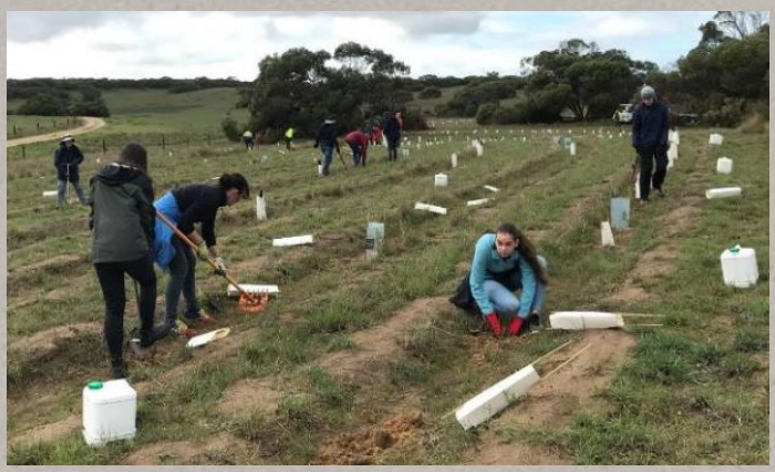
Planting at Mount Sandy, SA