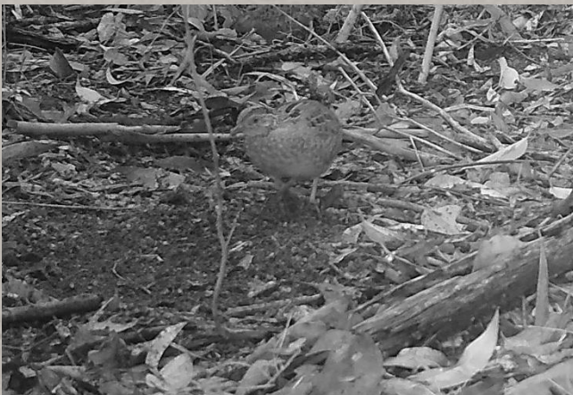
Painted Button–quail at feeding scrape

In our Spring 2021 ENews, we reported the discovery of Eastern Whipbirds here. In our Autumn 2022 ENews we presented the results of two years of bird surveys and gave a short history of the park. Toowoomba members of A Rocha have volunteered alongside Friends of the Escarpment Parks to remove weeds and encourage the regrowth of indigenous shrub species here for nearly three years. It is encouraging to see habitat improving, and to monitor the return of native species. This data will help to inform best practice management activities. The next quarterly survey of birds at Nielsen Park is planned for 13 October 2022.